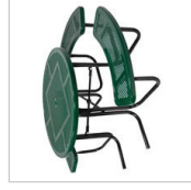
Ultra Play Systems ADA Round Heavy-Duty Picnic Table $862.99 - $939.99

Height: 31" Assembly: Assembly required Weight Capacity: 400 lbs. Seating Capacity: 2 Weight: 158.0 lbs. Shipping Method: Freight