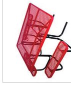
Nonwood Commercial Furniture ADA Square Picnic Table $685.88 - $734.88